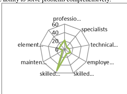
Fig. 2. Load level per one vacant workplace by occupational groups, on average for 2013-2018, pers. Built by the authors based on the data from the official website of the State Statistics Committee of Ukraine. URL: http://www.ukrstat.gov.ua/

the employers concerns such competencies as critical thinking and the ability to solve problems comprehensively.