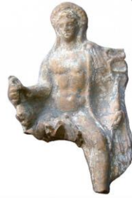
Теракотова статуетка Гермеса/Меркурія

Right: Ukrainian ballet dancer turned legend with Black Crow .