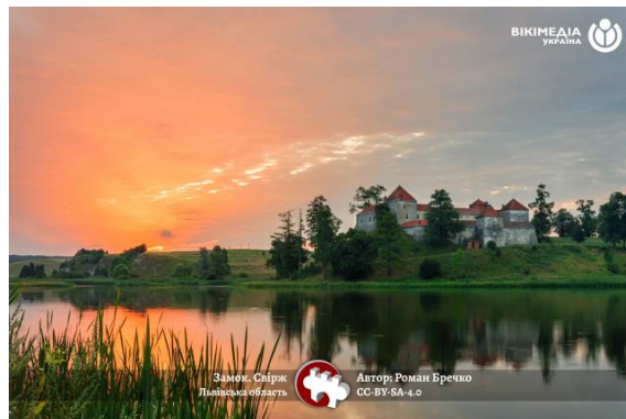
Left: Svirzh Castle. Ten best photos of Ukrainian monuments in 2018 Right: Lviv’s first monument : Stanislaw Jablonowski’s missing shadow

Meet the winners of “Top 30 Under 30” of 2018 awarded to young Ukrainians achieving outstanding results in different fields.