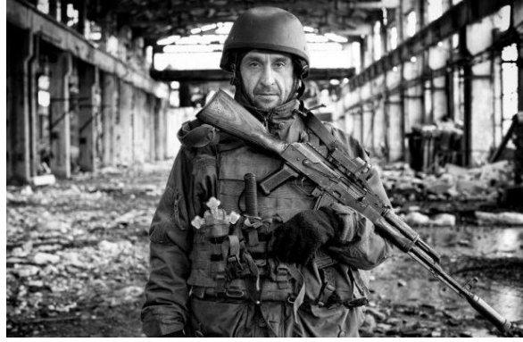
Photo of fallen Ukrainian soldier wins Gold prize in Tokyo photo contest