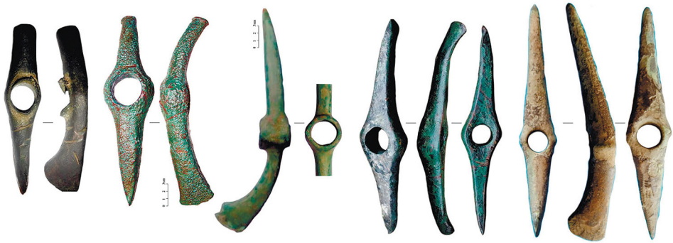
Fig. 2. Examples of the unique copper hammer-axes and pickaxes found in Ukraine. 1 – Vinnytsia region, 2 – Verben, Rivne region, 3 – Vinnytsia region, 4 – Cherkasy region, 5 – Chernivtsi region.

cluded 544 copper objects with a total weight of 1653 g (Dergachev and Parnov 2022, 7), and the Carbuna hoard which included 444 copper objects (Dergachev 1998, 29). In terms of total metal weight, the volume of known working tools is even greater. The most complete catalogue of Trypillia metal instruments published by V. Klochko (Klochko et al. 2020) lists more than 85 copper hammer-axes, flat axes and axe-adzes.