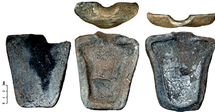
Fig. 6. Ceramic casting found near the town of Fastiv, Kyiv region.

tradition. The evidence of the local production of axes is the finding of several two-part closed casting forms. The first one was made in 1893 by V. Khvoika at the Kyrylivska Hora site situated within modern Kyiv, whilst the second one was made in 2022 near the town of Fastiv (Fig. 6). The most probable source of metallurgical raw material used by the craftsmen of the Sofievka local group is the Skvira deposits (Pavliuk and Pavliuk 2009b) of native copper and copper sandstone located 150 km to the south-west from the closest Sofievka site. At the end of their use, most of the copper items of the Sofievka culture were deposited as grave goods. According to material gathered by V. Klochko, 150 of the 202 known Sofievka metal objects were found within cremation burials (Klochko 1995, 205).