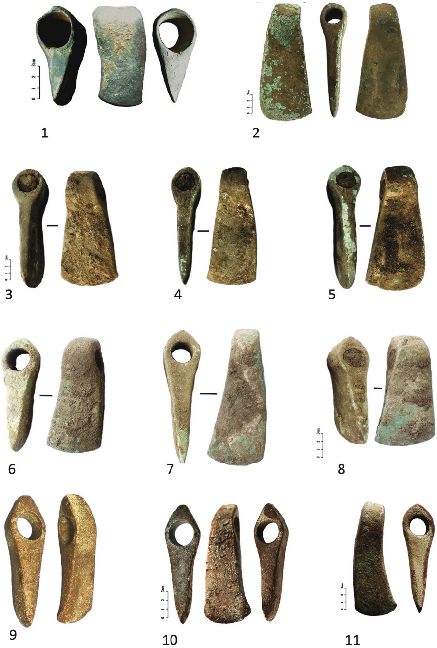
Fig. 5. New finds of the Samara type axes discovered in Ukraine. 1-8- Cherkasy region, 9 – Kharkiv region, 10 -Novi Petrivtsi, Kyiv region, 11 –Vinnytsia region.