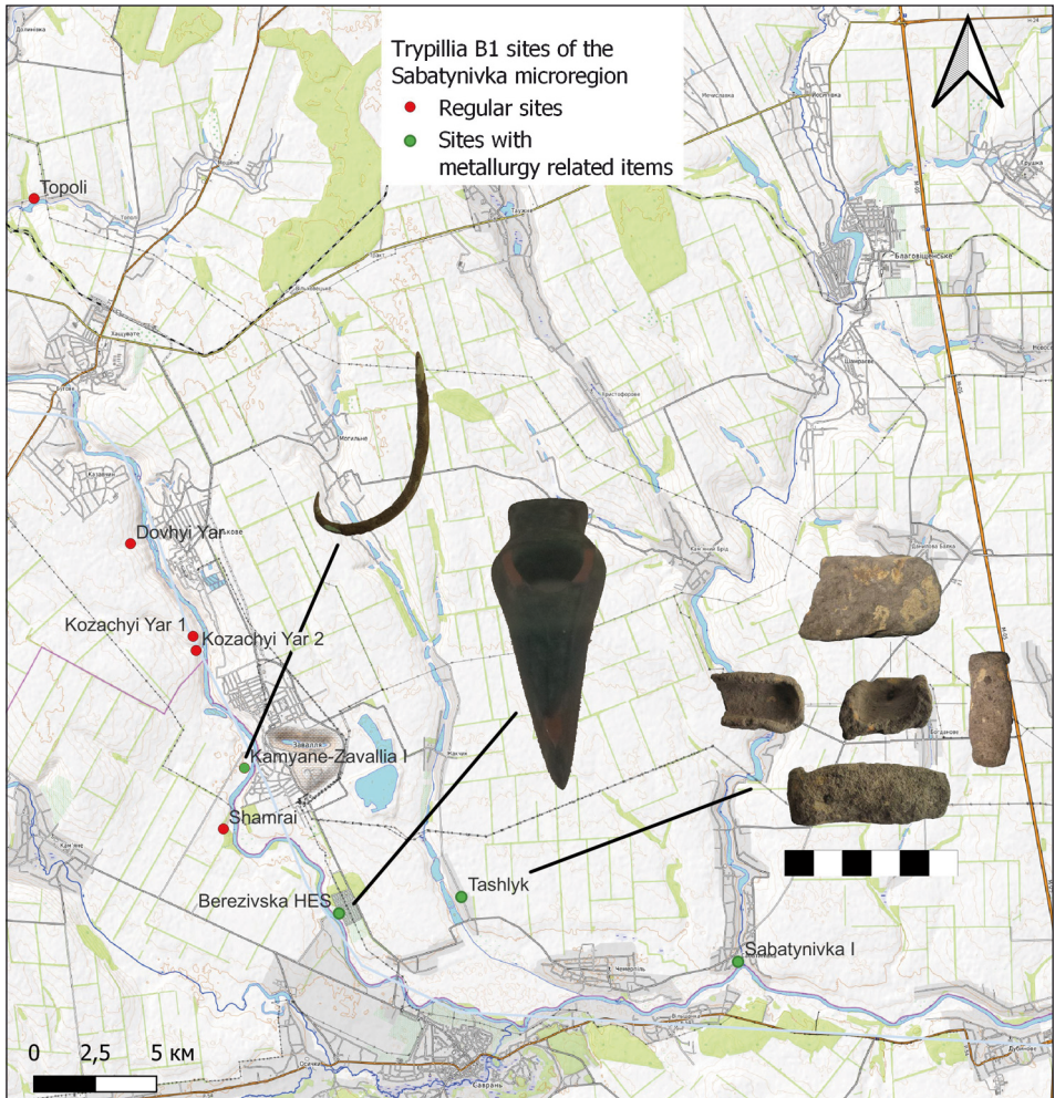
Fig. 3. Trypillia B1 sites of the Sabatynivka microregion located near native copper deposits of the Chemerpil area. Map after Kiosak and Lobanova 2021, modified by author

The oldest metal objects found in the region so far are the Vidra type axe from the cultural layer of the Trypillia B1 site Berezivska HES (Ryndina 1970, 19), a Pločnik type axe (Klochko et al. 2020, 12) found near the famous Trypillia BII-CI mega-site of Nebelivka (Gaydarska 2020), the Ariuşd type axes found near the village of Lysianka and within the Orativ district, and a Coteana type flat axe found near the town of Bohyslav.