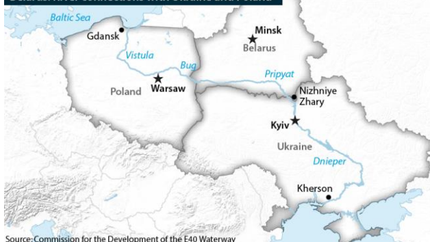
Belarus: River connections with Ukraine and Poland