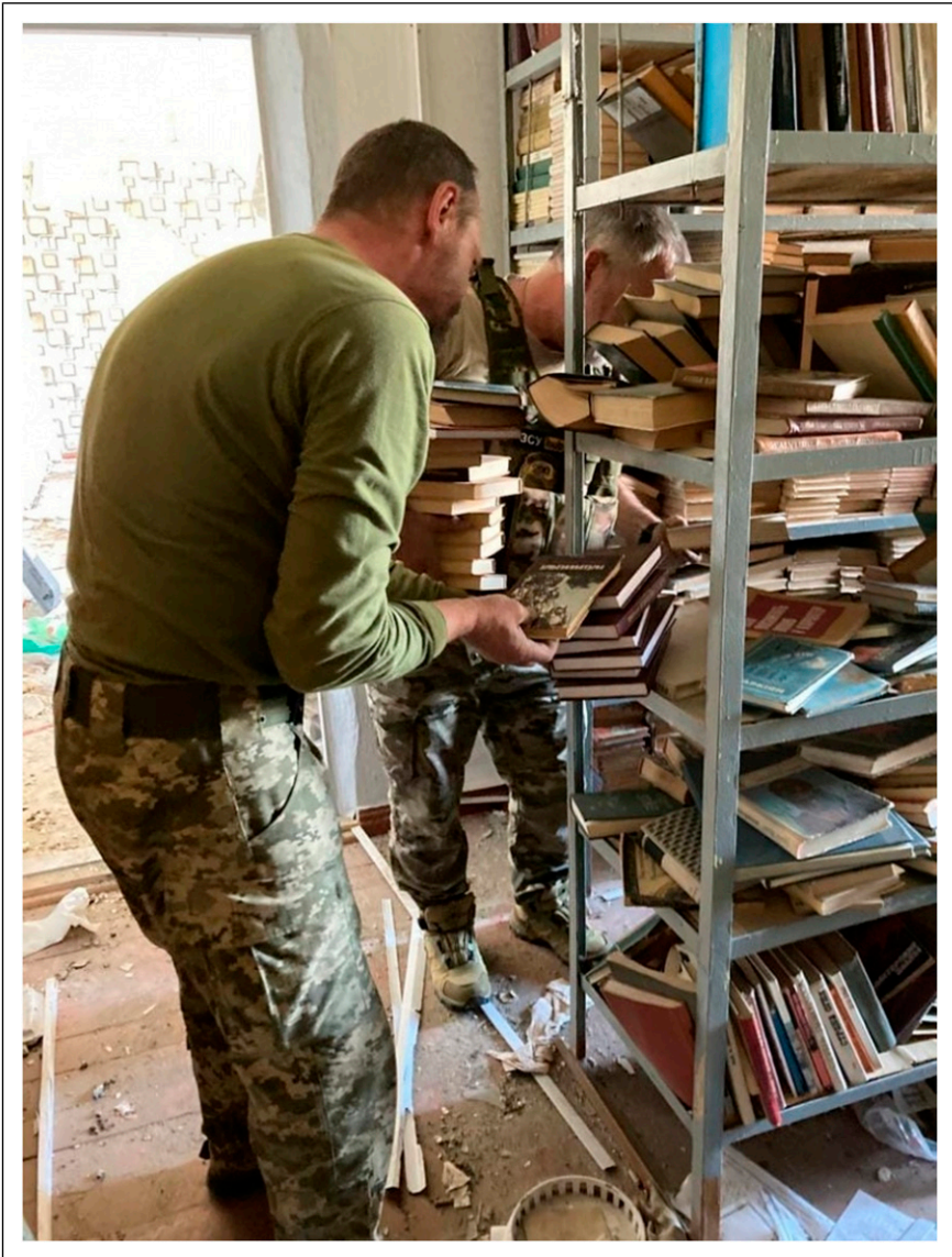
Figure 3. Ukrainian soldiers save 5 tonnes of books from Sieversk's libraries destroyed by Russians.