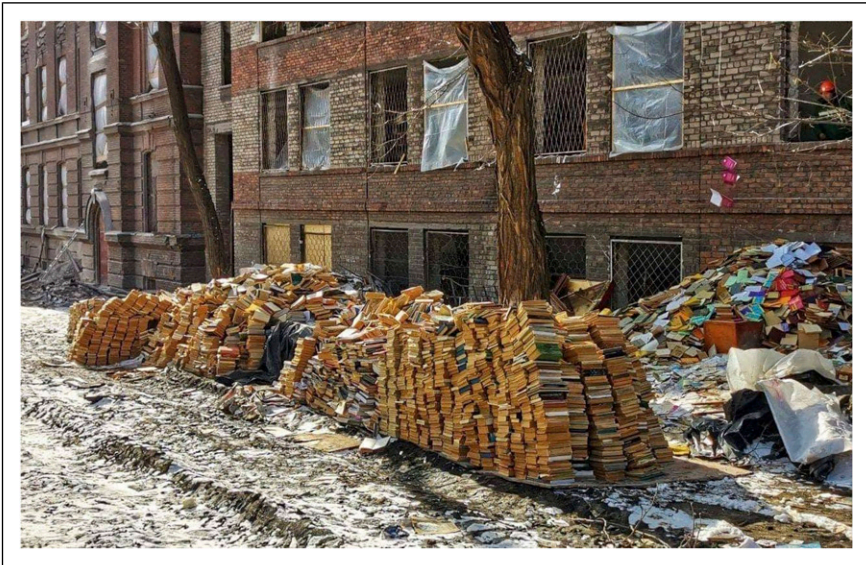
Figure 4. The occupiers threw away books from the University Library in Mariupol.

project concept note was presented on safeguarding documentary heritage to Ukrainian and international partners, in the context of the Memory of the World Programme. A key outcome was the setting up of a technical working group located in the Ukrainian Library Association and to begin groundwork on the setting up of the National Digital Library of Ukraine. The Project partners are UNESCO, the International Federation of Library Associations (IFLA), Ukrainian Library Association, Memory institutions in Ukraine and the Ministry of Culture and Information Policy of Ukraine (UNESCO) ( Government Portal, 2023 ).