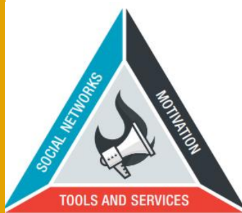
Figure 1. The Fake News Triangle

Left: The Fake news machine . How propagandists abuse the internet and manipulate the public. Trend Micro research Right: Three years of Estonian support for Ukraine . The story of Vaba Ukraina.