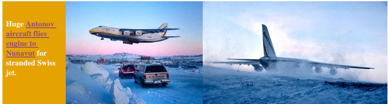
Huge Antonov aircraft flies engine to Nunavut for stranded Swiss jet .

Former Ukraine finance minister Natalie Jaresko named to manage Puerto Rico's financial crisis . She served at a critical time in Ukraine's history from 2014 to 2016.