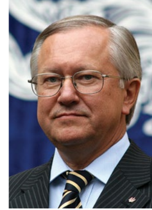
Ambassador Borys Tarasiuk Co-Chairman Kyiv Mohyla Foundation of America

Each nation has its own achievements throughout the centuries of which it is proud. For Ukrainians, one of these achievements is certainly Kyiv Mohyla Academy, founded 400 years ago. Then, as now, the National University of Kyiv Mohyla Academy is recognized as an institution of academic excellence.