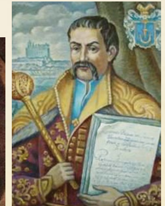
Hetman Pylyp Orlyk