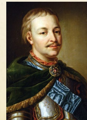
Hetman Ivan Mazepa

The growth of the academy came during a period of increasing political tension - pressure from Poland from the west, an increasingly aggressive stance of Russian czars from the north, and the rising power of the Ottoman Empire from the south - all of whom vied for Ukrainian lands. With the destruction of the Zaporzhian Sich in 1775 by Russian armies, Ukraine was subsumed into the Russian Empire. Emperor Nicholas I closed Kyiv Mohyla Academy in 1817. As the Russian Empire collapsed, Soviet forces assumed power in Ukraine, and in the 1920s authorities confiscated the academy's vacant location in Podil, establishing a naval training school.