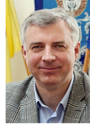
Serhiy Kvit President of NaUKMA Minister of Education of Ukraine

We inherited a powerful moral and intellectual legacy from our ancestors. Integral to the ethic that guides the National University of Kyiv Mohyla Academy is the belief that we all share responsibility for each other and for the fate of our nation. An obligation to Ukraine's well-being is woven into the moral fabric that guides us through the examples of Petro Mohyla, Hryhoriy Skovoroda and other prominent national leaders who studied and taught at Kyiv Mohyla Academy through the years, heroes who offer us courage and inspiration.