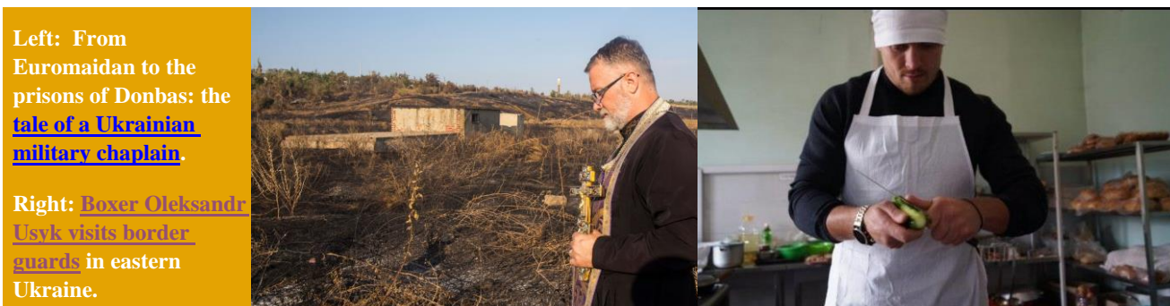
Left: From Euromaidan to the prisons of Donbas: the tale of a Ukrainian military chaplain .

Ukrainian veterans take part in US Marine Corps Marathon .