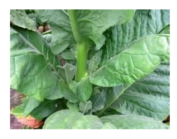
Nicotiana tabacum, or cultivated tobacco, is a perennial herbaceous plant