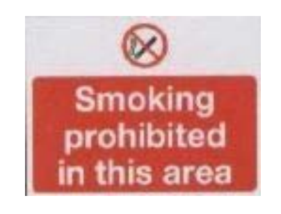
Posters that prohibit smoking

Cigarette production in United States decreased by about 34 %, export decreased by about 34%, and consumption dropped by about 31 % (from 525.0 in 1990 to 360.0 billions cigarettes in 2007) during period of time from 1990 till 2007 [24].