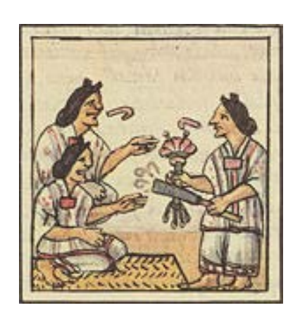
Aztec women are handed flowers and smoking tubes before eating at a banquet, Florentine Codex, 1500

After discovering America by Christopher Columbus in 1492 tobacco has been transferred to Europe where its triumphal invasion began. The same influence of tobacco smoking was observed in Asia continent.