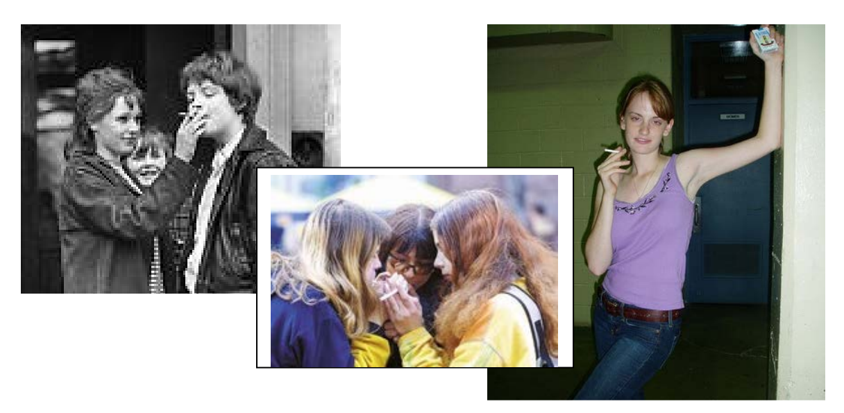
The relatively early attempt to start smoking among the younger generation is observed in Ukraine

One impediment to changing this disastrous increasing frequency of smoking in the Ukraine is that many Ukrainian physicians, who should be implementing an anti-tobacco policy among their patients, actively use tobacco themselves. In all, 13.9% of physicians were current smokers and 21.6% reported being past smokers, with significantly more men than women in either category [37].