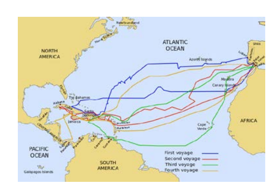
12 October 1492 – Christopher Columbus discovers The Americas for Spain

After discovering America by Christopher Columbus in 1492 tobacco has been transferred to Europe where its triumphal invasion began. The same influence of tobacco smoking was observed in Asia continent.