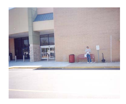
Place for Smoking (State of Georgia, USA).

The 2006 Surgeon General's report informs that "The good news is that, unlike some public health hazards, second-hand smoke exposure is easily prevented "— said Surgeon General Richard H. Carmona. Application of biological marker for second-hand smoke exposure made it possible to establish that the proportion of non-smokers has been halved from 88 percent in 1988-91 to 43 percent in 2001-2002 [23].