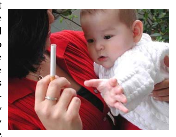
Tobacco smoke exhaled by smokers (passive smoking) is dangerous for people who do not smoke, especially for children

It is interesting that one does not actually have to smoke to suffer the consequences of smoking. Second-hand smoke is the combination of direct tobacco smoke given off by the burning end of the cigarette and the smoke exhaled by the smoker. The 2006 Surgeon General's report informs that nearly half of all nonsmoking Americans are still regularly exposed to second-hand smoke; the only way to protect non-smokers from the dangerous chemicals in second-hand smoke is to eliminate smoking indoors. Exposure to second-hand smoke can cause similar health problems, including cancer, in otherwise healthy adults.