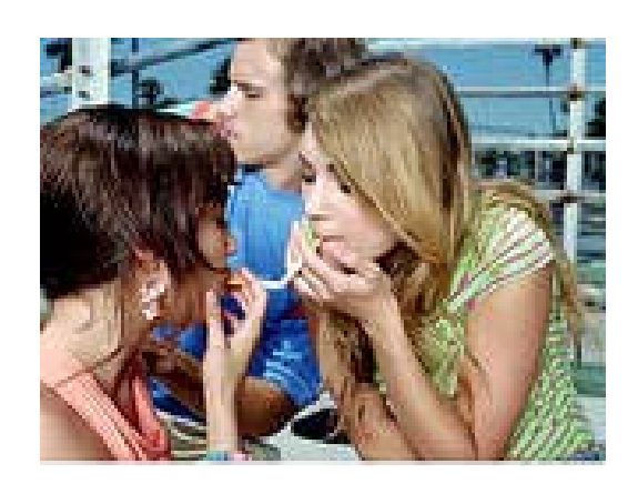
Women with education, especially young girls and those who are living in big cities are the most active tobacco consumers

It was shown that 57 % of men and 10% of women were current smokers and an additional 21 and 7%, respectively, were ex-smokers [32]. Smoking behaviour has changed considerably over successive generations, with an increase in the proportion of women smoking and a reduction in the mean age at which smoking is taken up. Factors associated with smoking include young age, urban residence (among women), and material hardship, in particular unemployment.