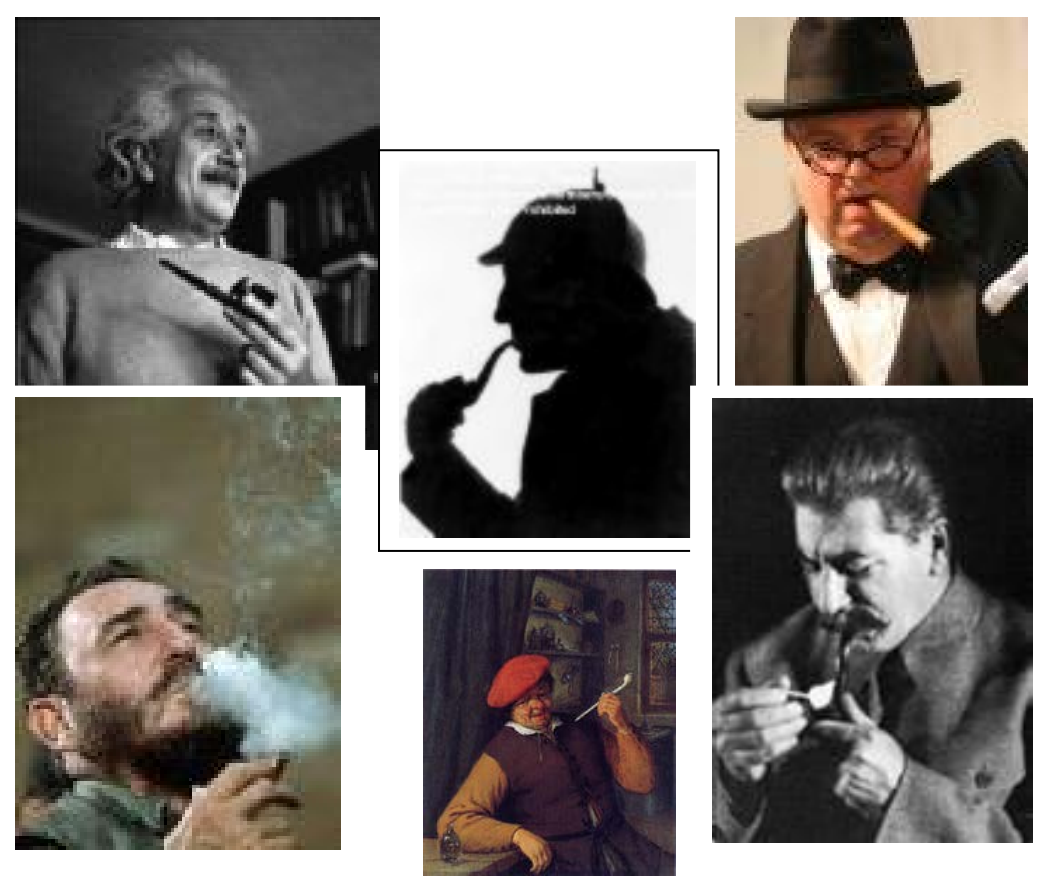
Examples of prominent figures - representatives from politics, science, culture, literature heroes and artistic images to promote smoking

By the way, Wayne McLaren, an American model, actor, and rodeo performer, famous with his promotional work for the Marlboro cigarette advertising campaign as the "Marlboro Man", has died from the lung cancer in 1992.