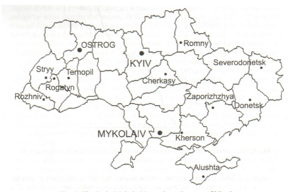
Fig. 2. The Kyiv-Mohyla Network on the map of Ukraine

There are two other Universities which belong to the Network. These are former UKMA branches that are now fully-fledged tertiary education institutions: National University of Ostroh Academy in the Western part of Ukraine and Petro Mohyla Mykolaiv State Humanitarian University in the South.