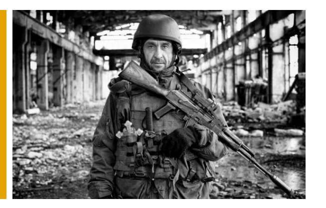
Photo of fallen Ukrainian soldier wins Gold prize in Tokyo photo contest