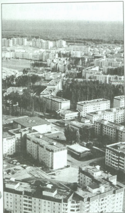
A revived town after Chernobyl