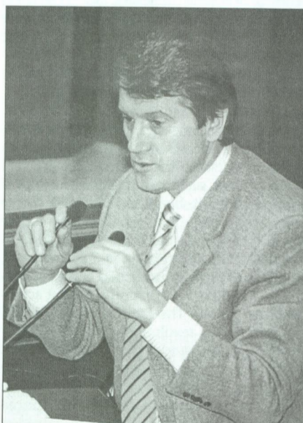
NU's Yushchenko speaks

The parliamentary election campaign presented Ukraine with several interesting new "parties," not all of them successful. However, the process itself pleased observers