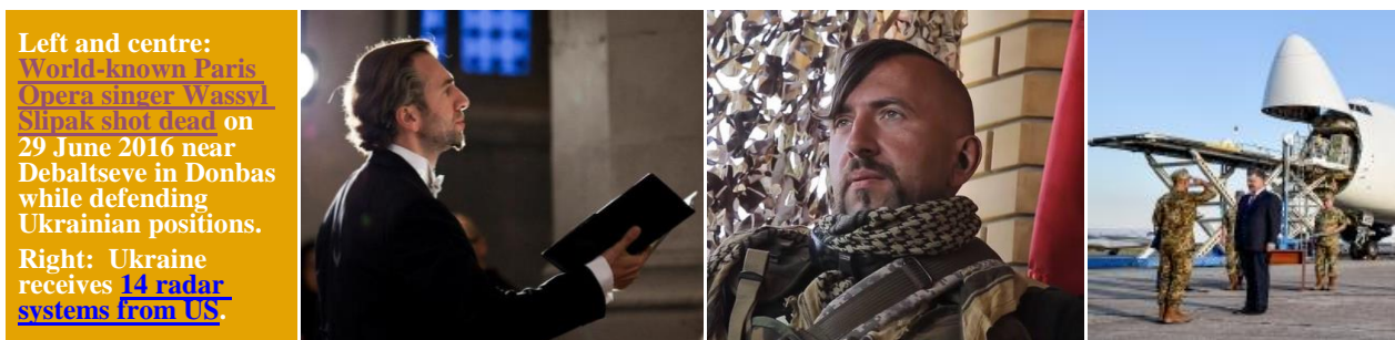
Left and centre: World-known Paris Opera singer Wassyl Slipak shot dead on 29 June 2016 near Debaltseve in Donbas while defending Ukrainian positions.

Russia imposes new restrictions on transit of Ukrainian goods .