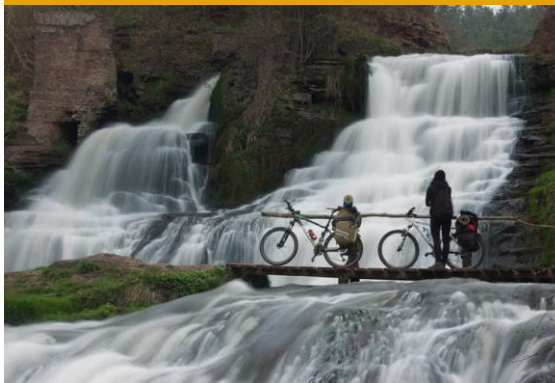
Left: Dzurynsky Waterfall. Ternopil Region

32-year-old message in a bottle found in a train compartment that was turned into a playground attraction.