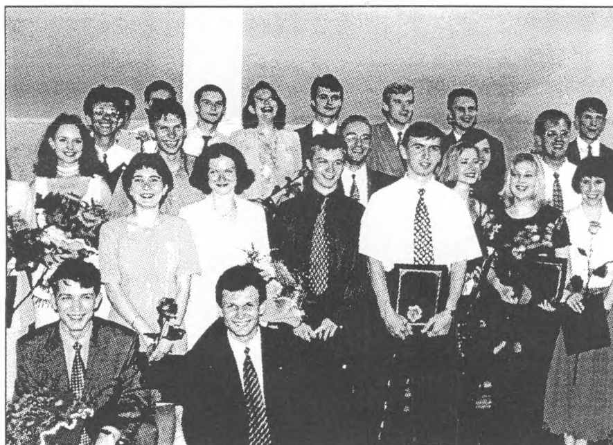
1999 EERC Graduates