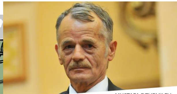
MUSTAFA DZHEMILEV member of the Ukrainian Parliament, former Chairman of the Mejlis of the Crimean Tatar People, about the terroristic act in Paris office of Charlie Hebdo:

"ISIL is not a fully independent force... Many analysts concur that the Moscow is interested in shifting the focus of France's foreign policy from the activities aimed to oppose the Russia's aggression towards Ukraine to anti-Islamic trends and, possibly, even to the split of the European Union".