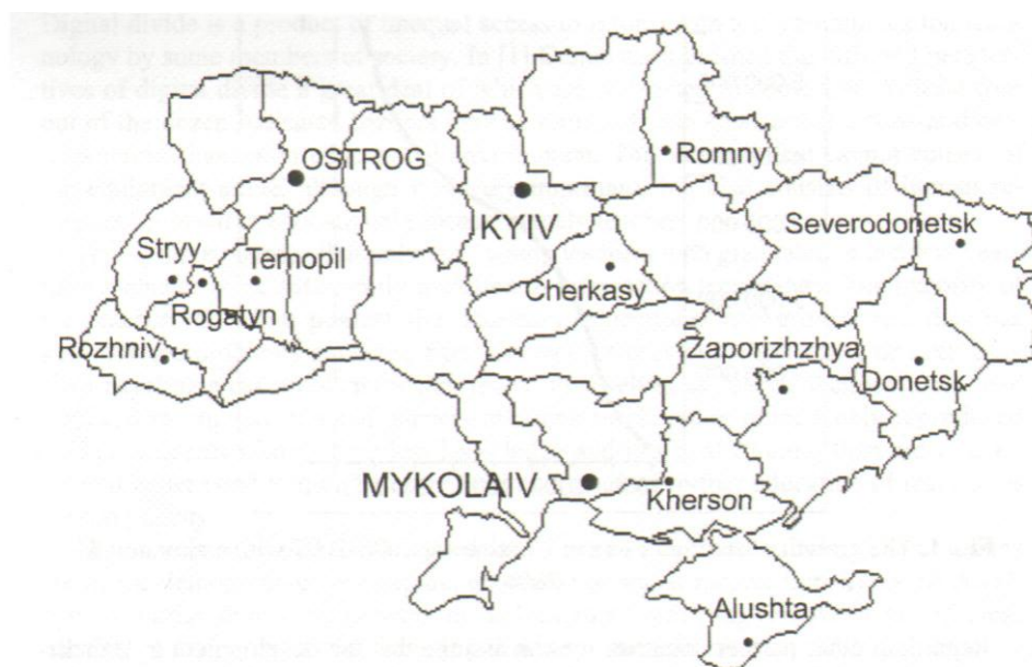
Fig. 2. The Kyiv-Mohyla Network on the map of Ukraine

There are two other Universities which belong to the Network. These are former UKMA branches that are now fully-fledged tertiary education institutions: National University of Ostroh Academy in the Western part of Ukraine and Petro Mohyla Mykolaiv State Humanitarian University in the South.